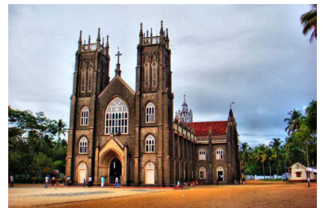
St. Andrew's Basilica in Arthunkal