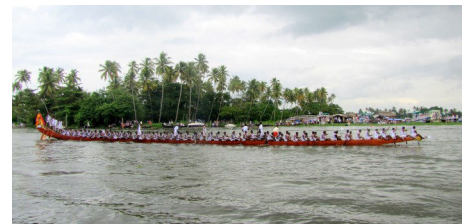
Snake Boat Race