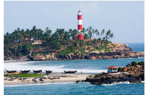
Alappuzha Light House