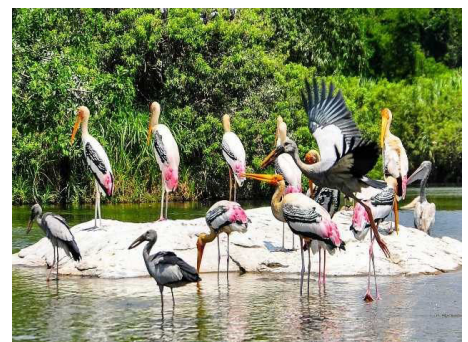
Kumarakom Bird Sanctuary