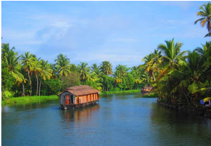
Houseboat in the Backwaters of Alappuzha

Karimadi Kuttan, a 9th century black granite statue of the Buddha in Karumady; Marari Beach; and St. Andrew's Basilica constructed in the 16th century in Arthunkal are some of the other major tourist attractions near Alappuzha.